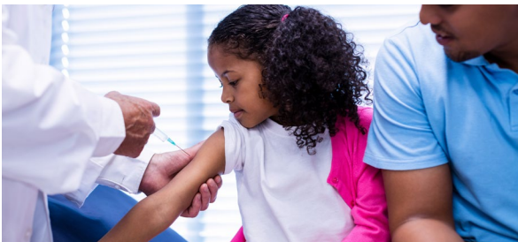
Access to vaccinations

Access to health services is important for all residents of Moreno Valley, but is especially important for the City's most vulnerable populations. Health specific services such as free or reduced-price clinics, and educational programs can provide important health access to low-income residents and those without healthcare. Supportive services such as counseling and employment-focused programs can be essential to the health and wellbeing of many Moreno Valley residents including young people, individuals experiencing homelessness, and formerly incarcerated individuals.