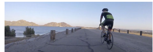
Lake Perris Bike Trail