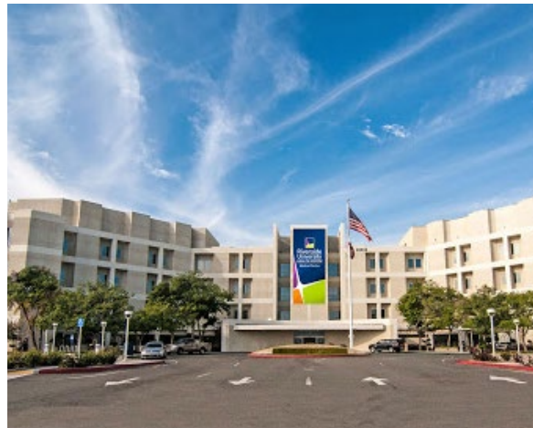
Riverside University Health System Medical Center

A top priority for Moreno Valley is increased healthy activity and mobility for all ages. The General Plan strives to achieve this through pedestrian, bicycle, and transit improvements that decrease the need for car travel, particularly for day-to-day activities. Investing in pedestrian and bicycle infrastructure will bring healthy physical activity into daily routines. For those that do not have access to cars, such as seniors and young people, a move away from car-oriented infrastructure will improve health and also improve mobility and quality of life. Furthermore, making recreation facilities more accessible—dispersing them throughout the community and making programs