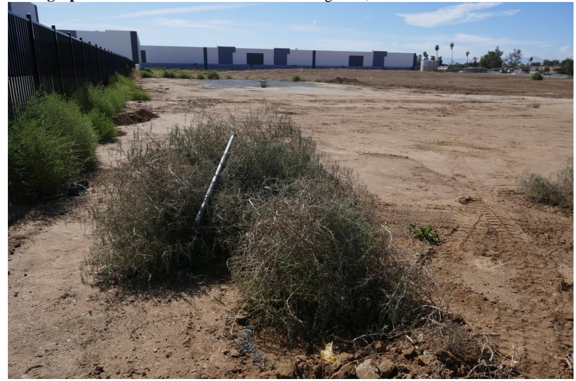
Photograph 2: Northeastern corner of site looking south, October 2021.

Photograph 1: Northeastern corner of site looking west, October 2021.