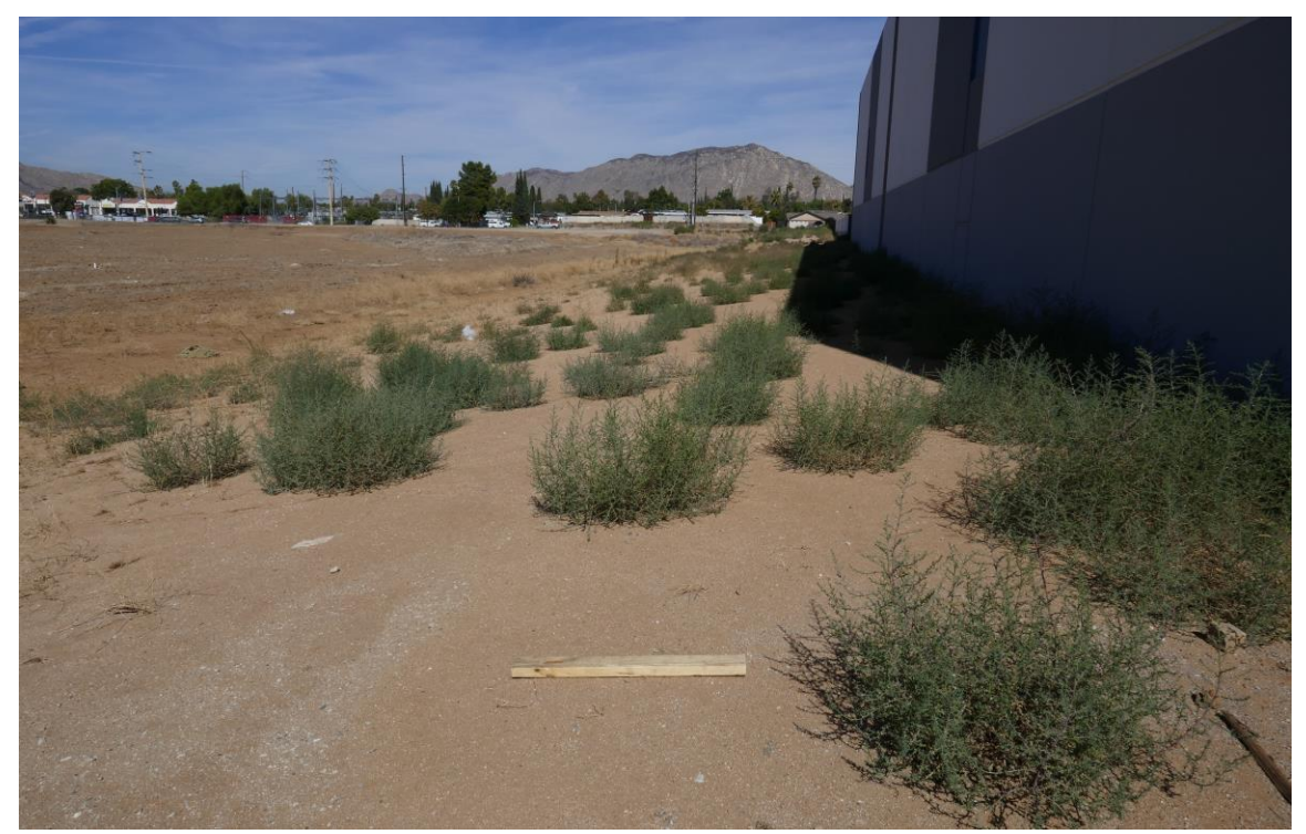
Photograph 3: Southeastern corner of site looking north, showing temporary detention basin, October 2021.