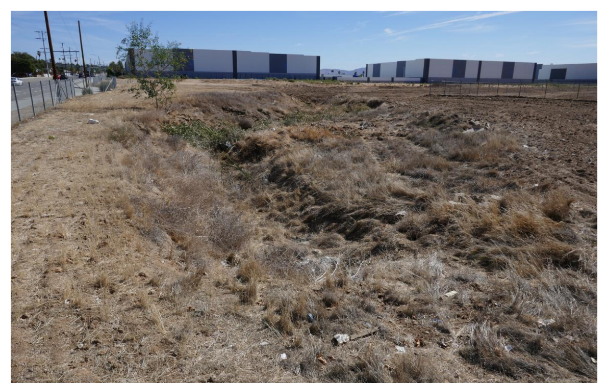
Photograph 7: Northwestern area of site, looking east along remnant channel, October 2021.