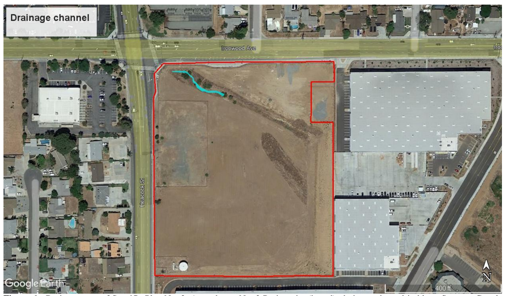
Figure 6: Drainage map of Specific Plan No. 2, Amendment No. 2 Project site (in red), drainage channel in blue.