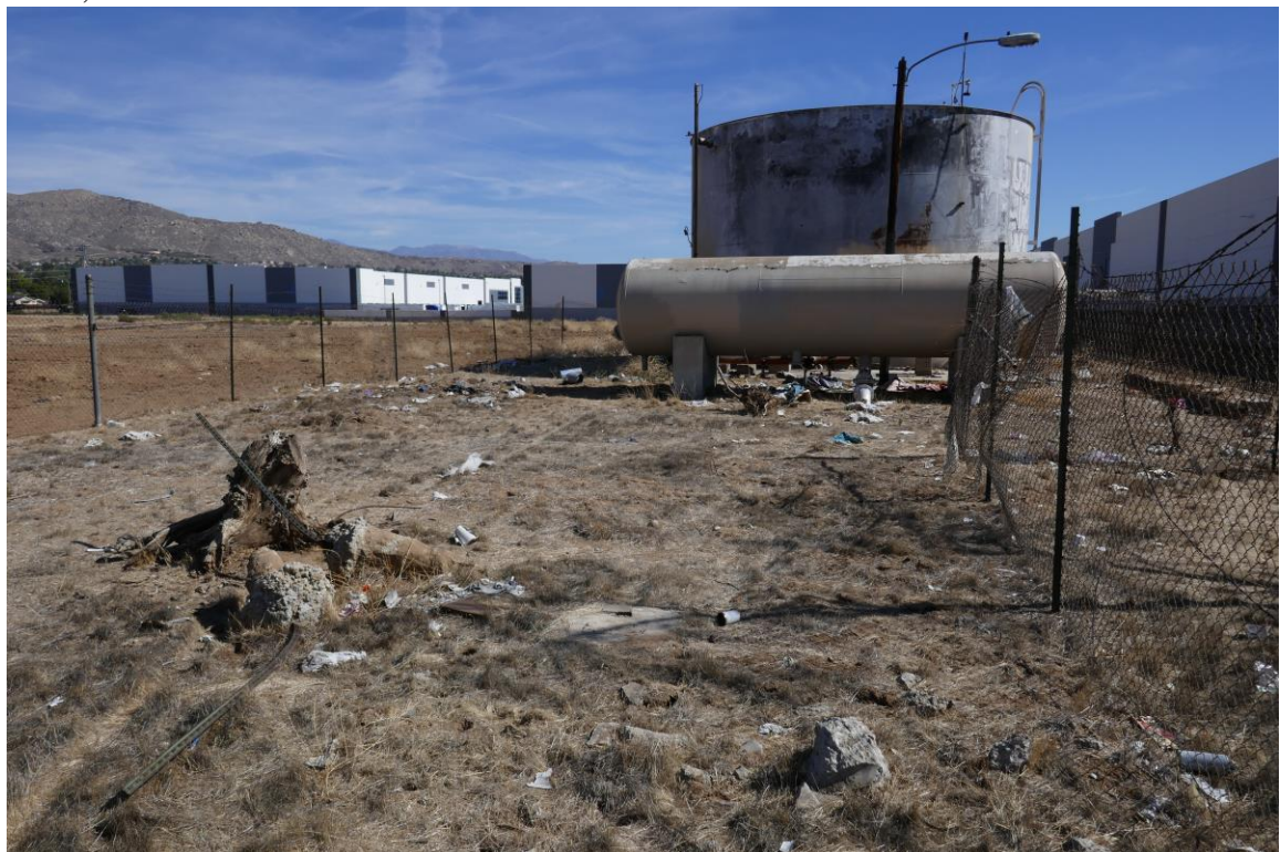
Photograph 4: Southwestern corner of site looking east, October 2021.