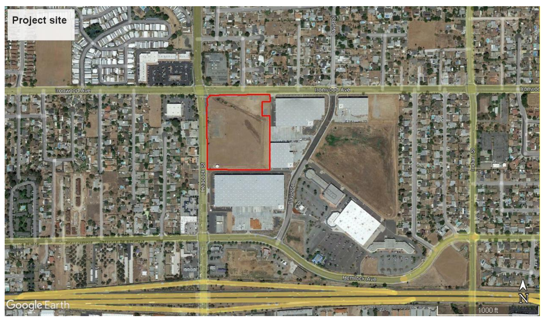
Figure 3: Specific Plan No. 2, Amendment No. 2 Project site (in red).