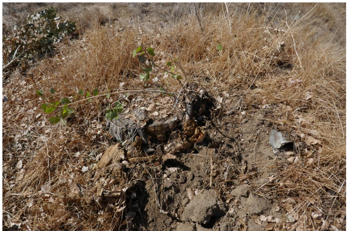
Photograph 10: Surviving Fremont cottonwood in remnant channel, October 2021.