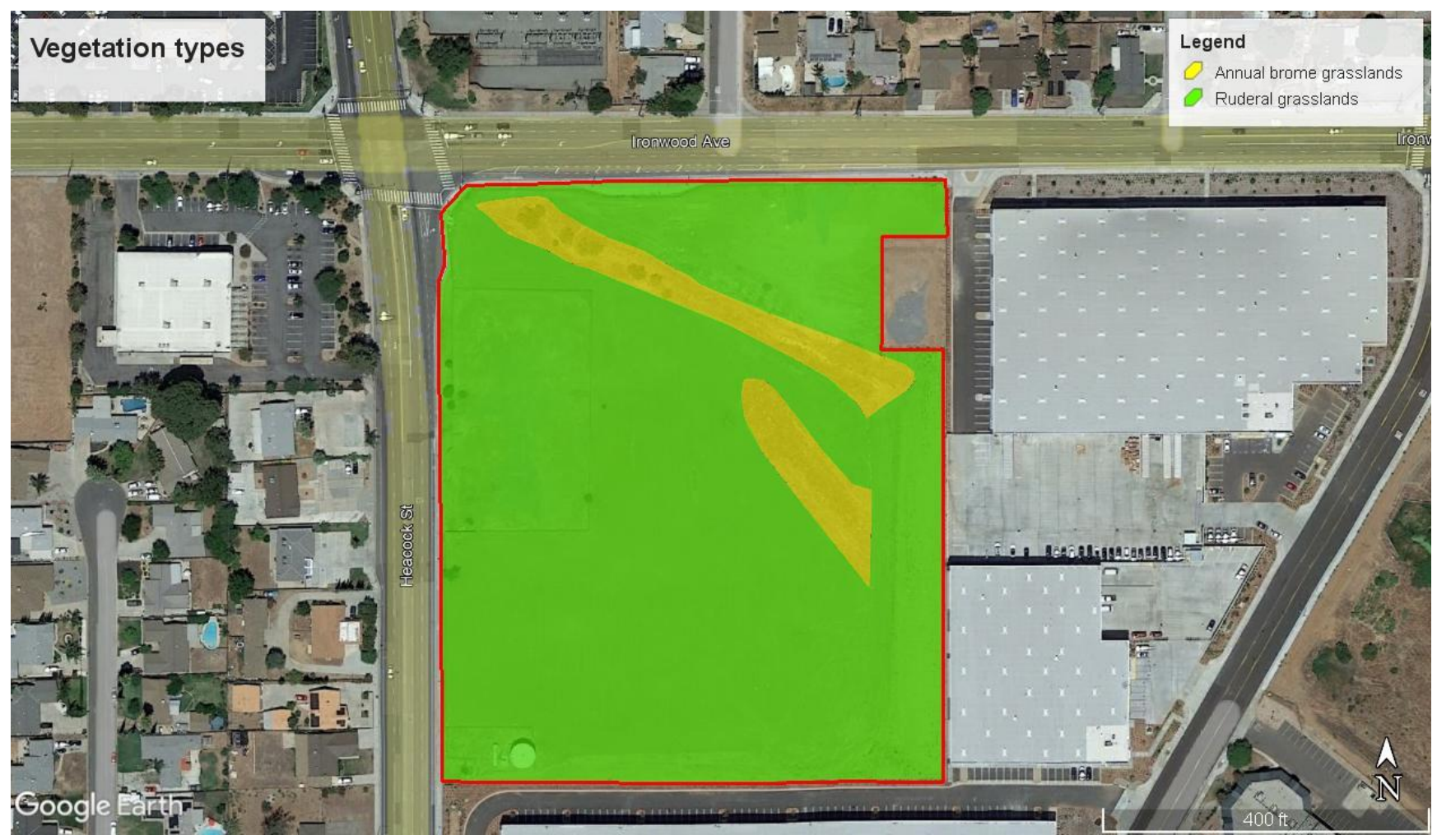
Figure 5: Vegetation map of Specific Plan No. 2, Amendment No. 2 Project site (in red).