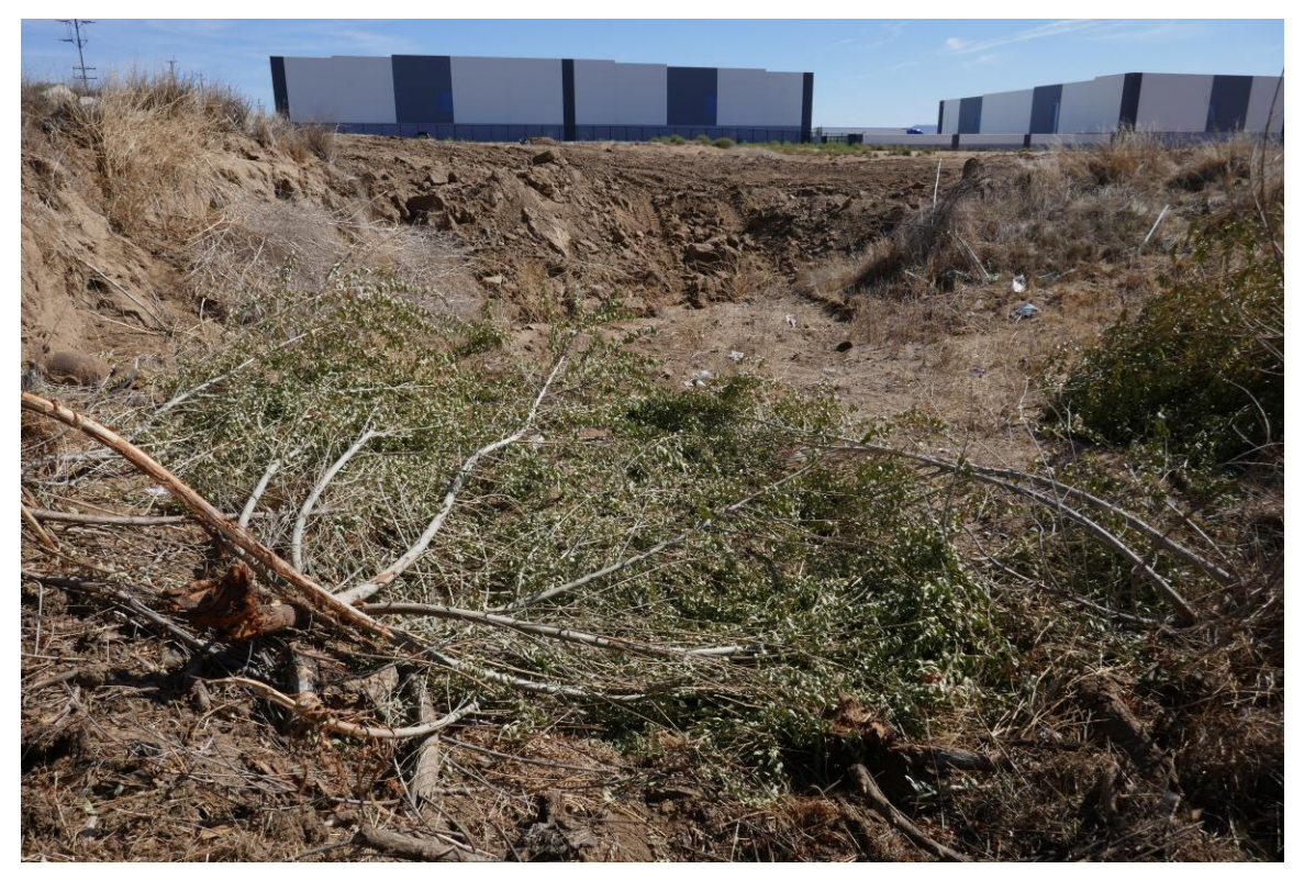
Photograph 9: Northwestern area of site, looking east along remnant channel, October 2021.