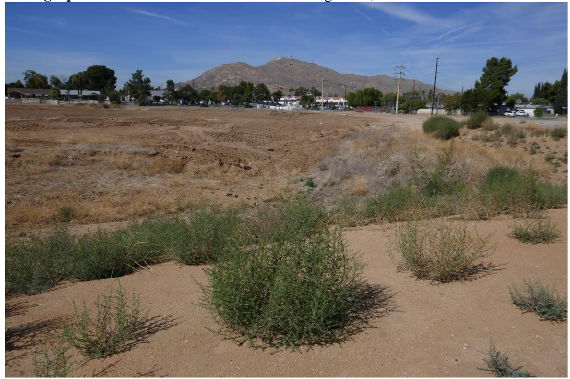
Photograph 6: Eastern boundary of site, looking northwest, October 2021.

Photograph 5: Northwestern corner of site looking south, October 2021.