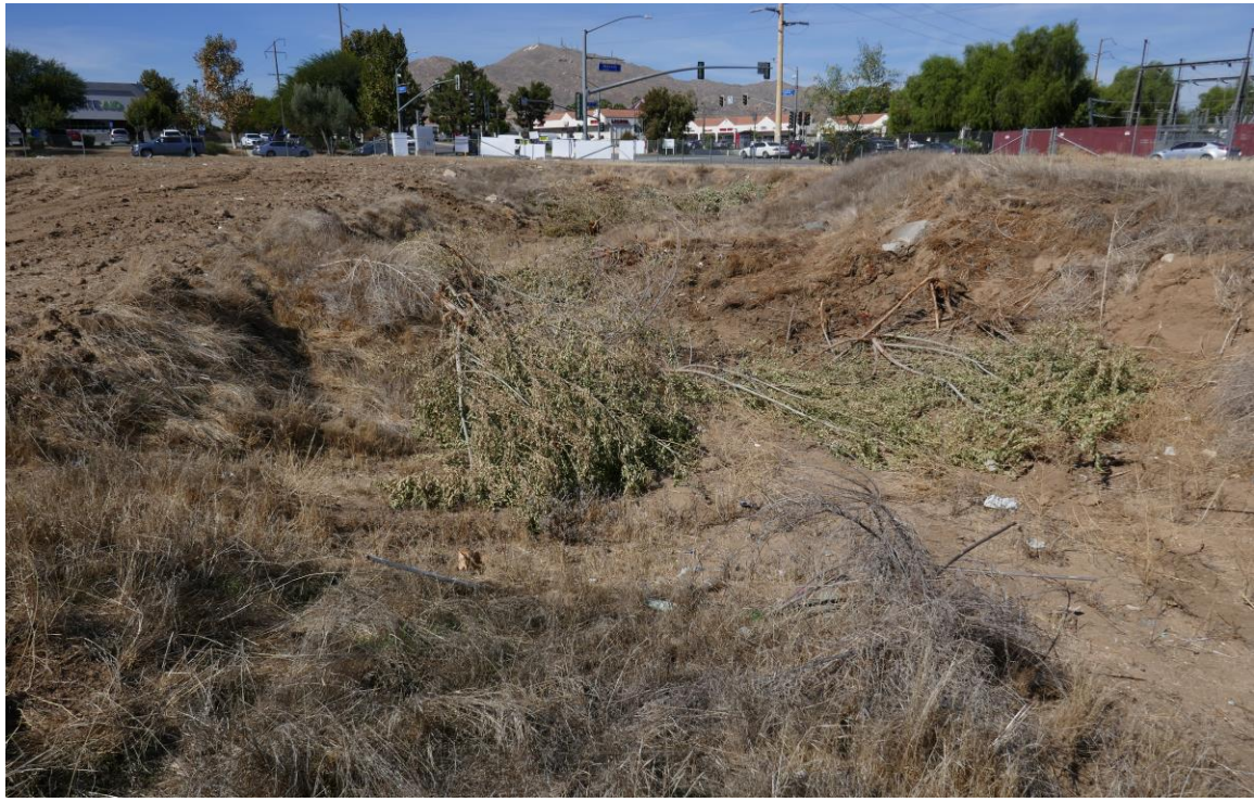
Photograph 8: Northwestern area of site, looking east along remnant channel, October 2021.